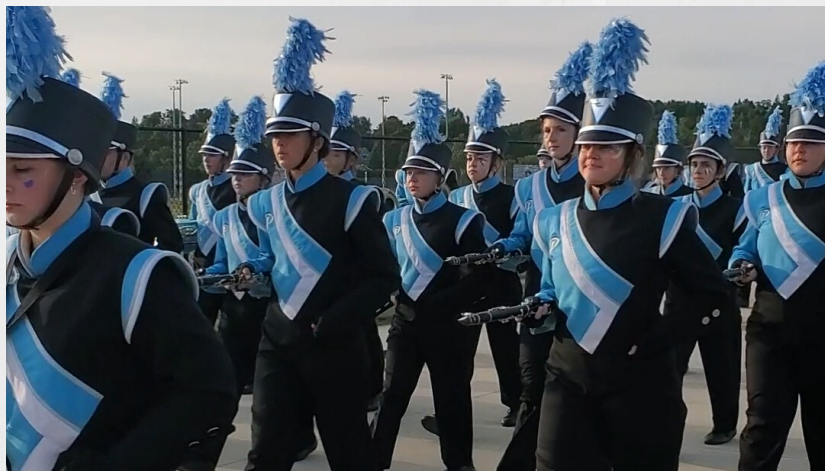
High School Marching Band - Marching into Northmen Stadium.